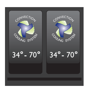
Dual Zone System featured in 3036RRGL

Adjustment and configuration of shelves allows for storing taller items